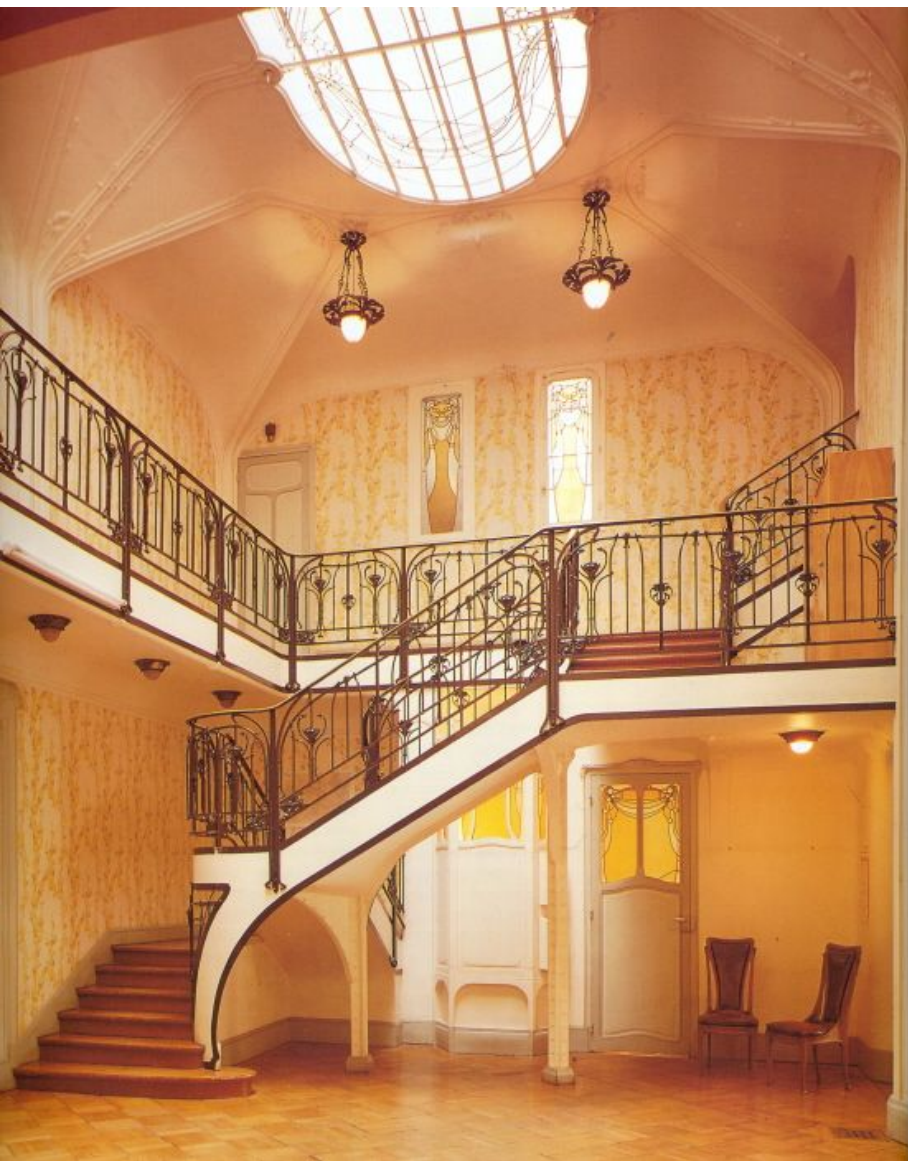
Hector Guimard. Hotel Mezzara, 1911