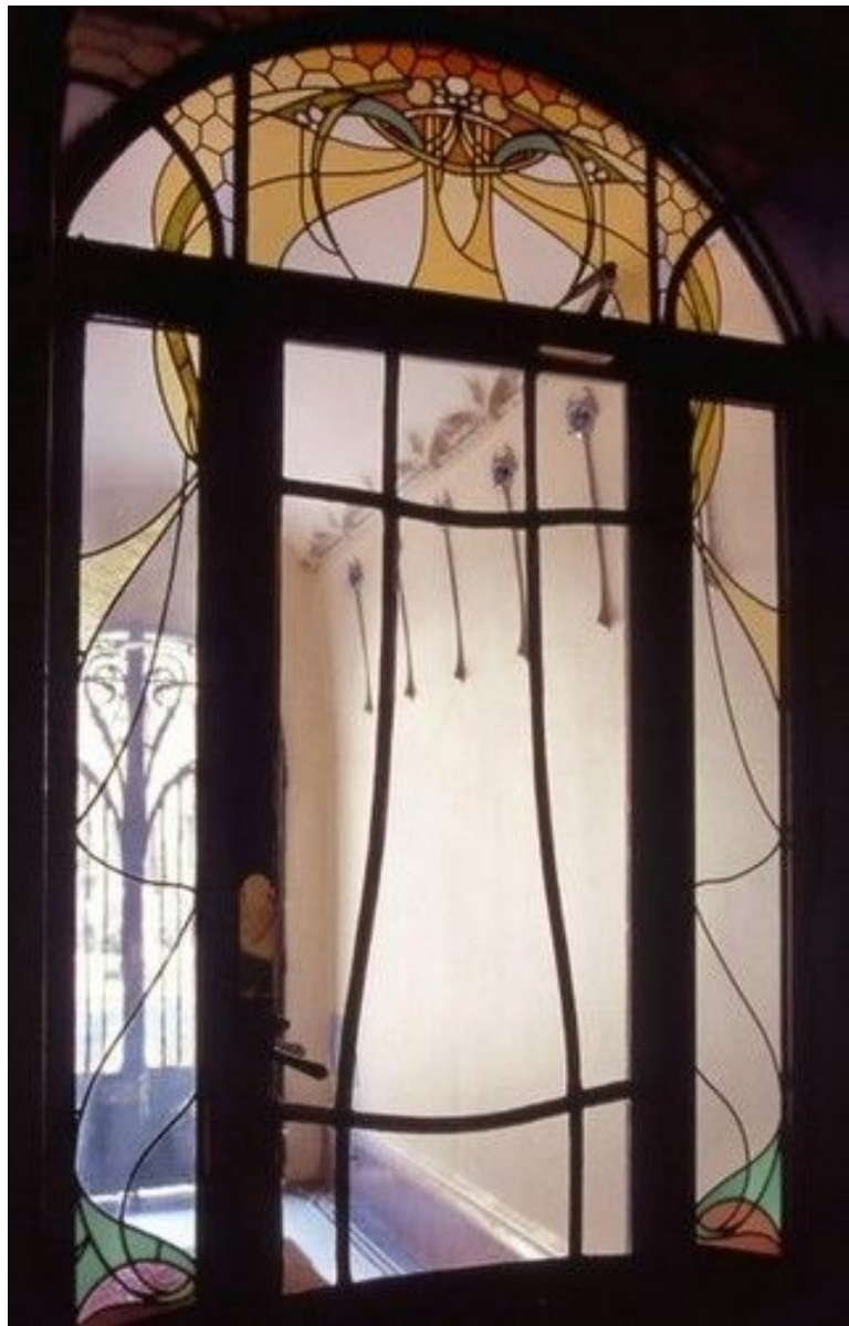
Guimard - Immeuble Jassede 1903