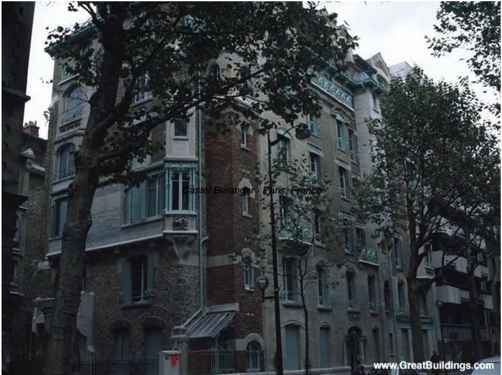
Castel Beranger - Paris, France