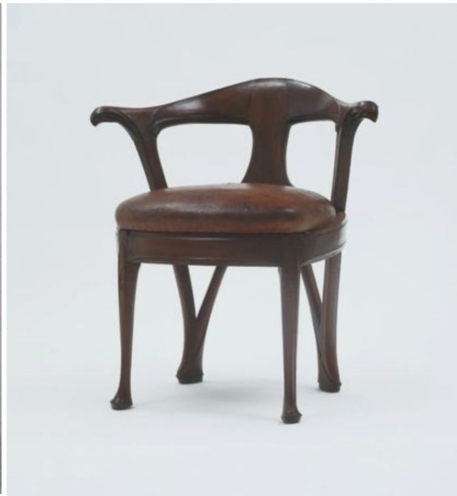
Hector Guimard Armchair. c. 1899-1900. Walnut and leather 82.3 x 78.1 x 53.3 cm, seat h. 52.7 cm