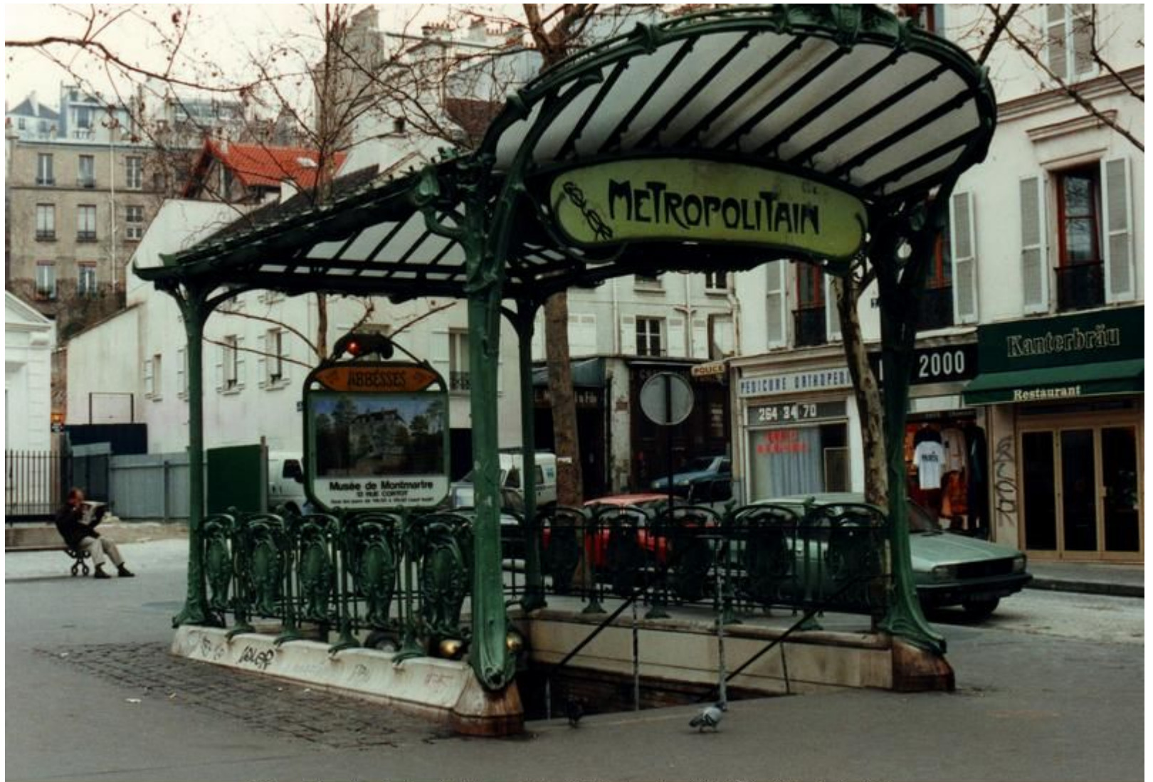
© Frank Derville : Guimard - Abbesses Metro Station (previously Hôtel de Ville), Paris - 1900