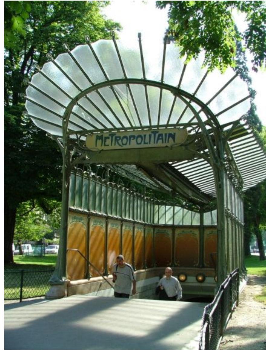
Metro station Paris 1900