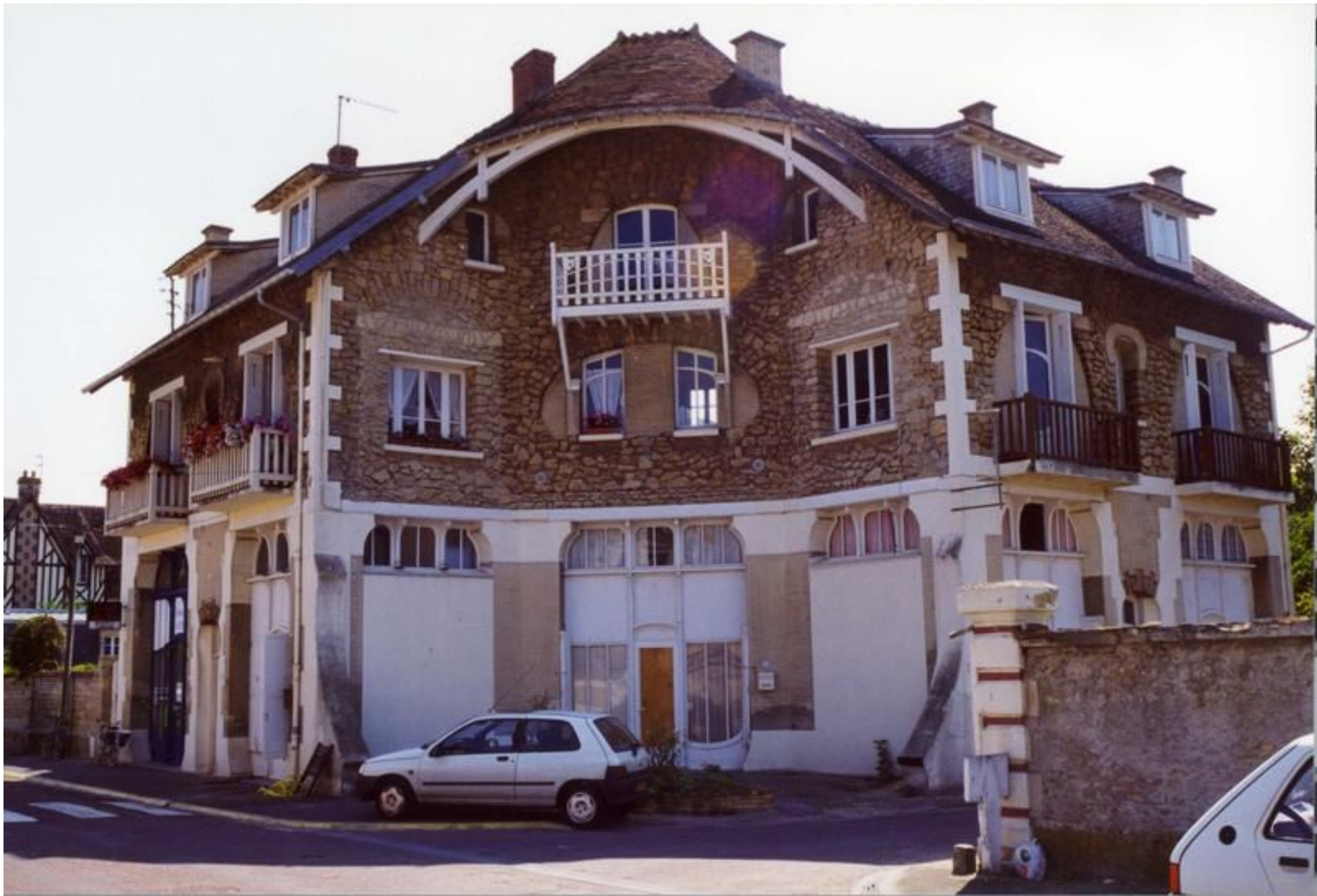
© Frank Derville : Guimard - La Sapinière, Hermanville sur Mer, France - 1903