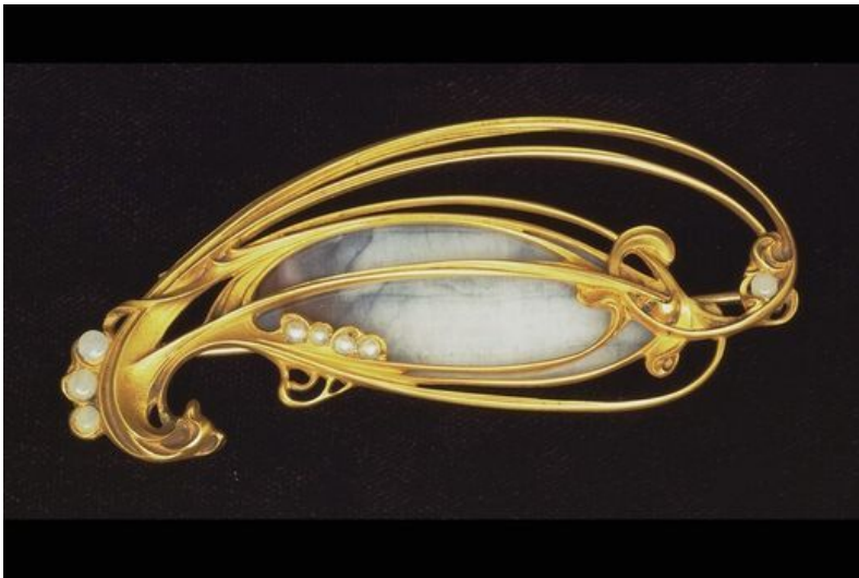
Brooch. c. 1909. Gold, agate, pearls, and moonstones, 4.1 x 9.5 cm