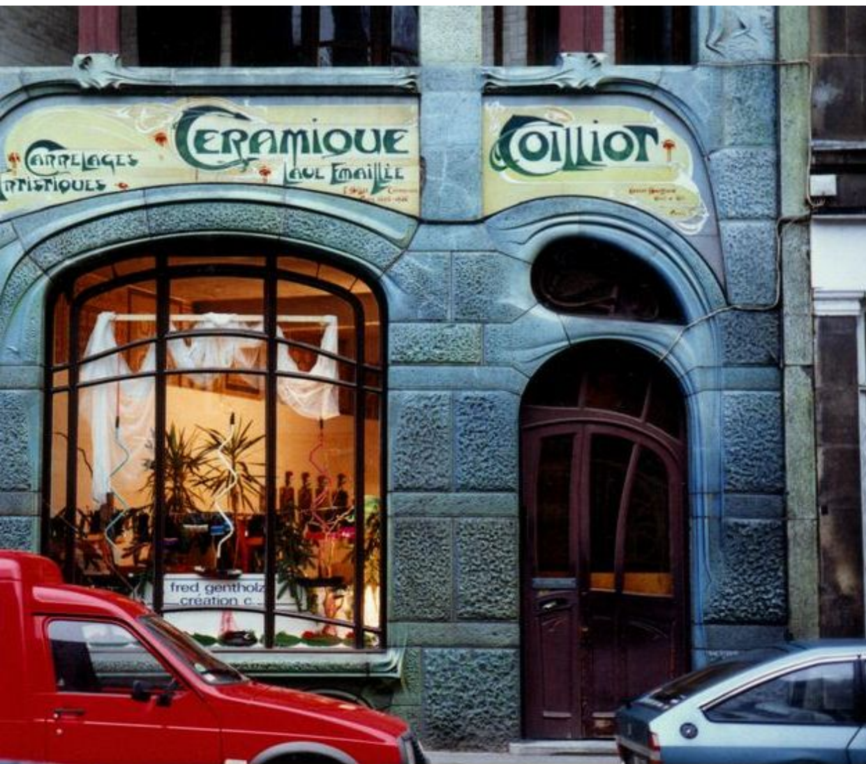
© Frank Derville : Guimard - Maison Coilliot, 14 rue Fleurus, Lille, France - 1900