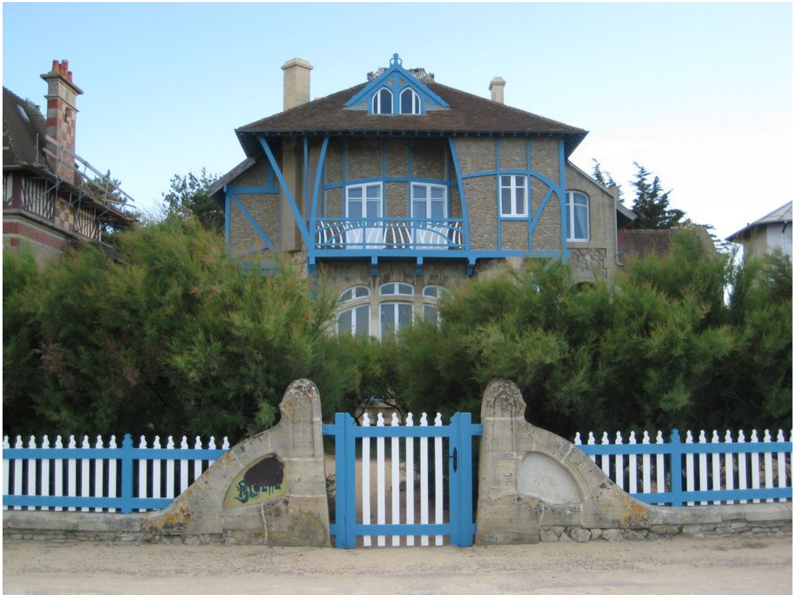
Hector Guimard villa 1899