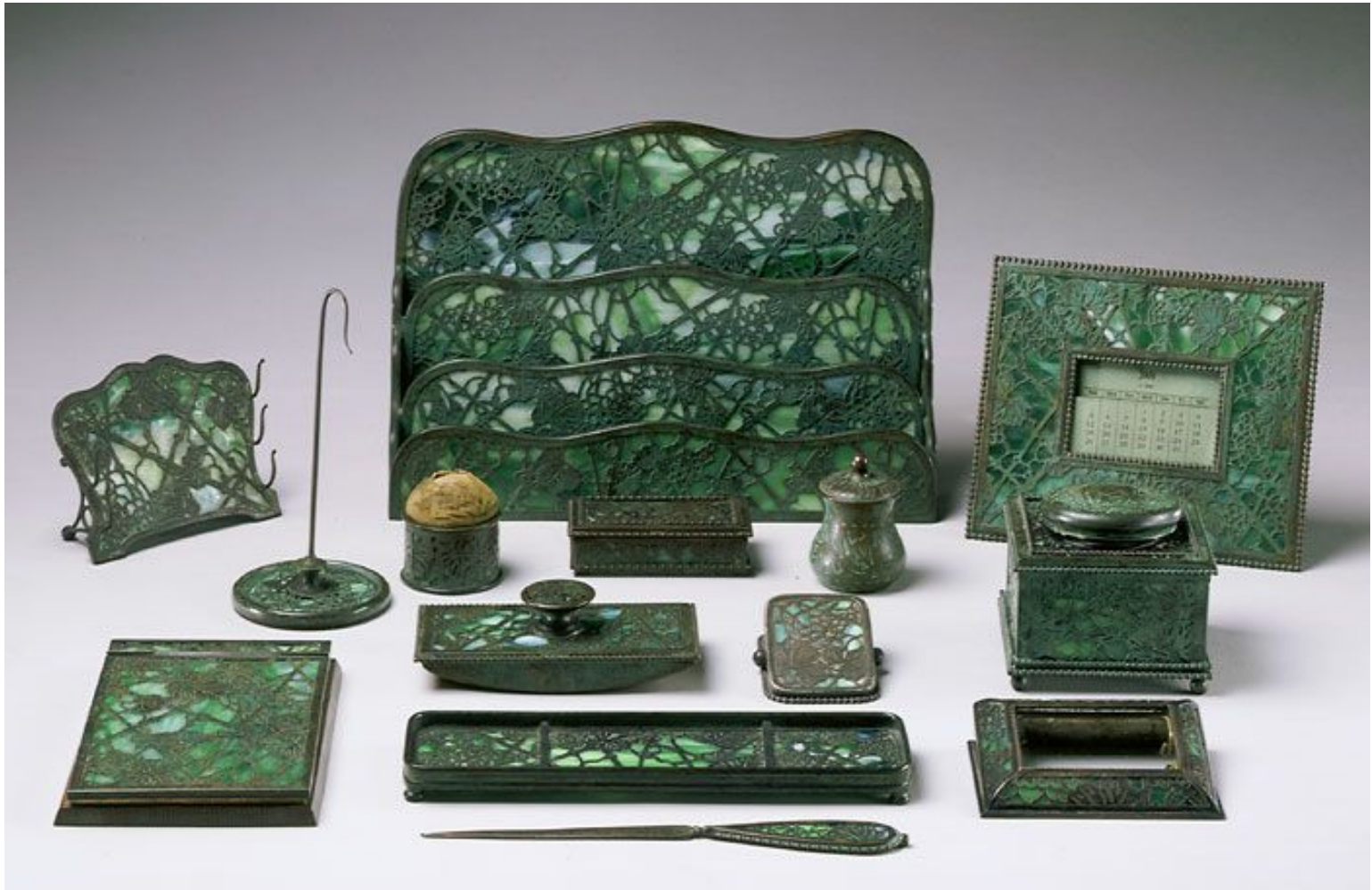
Louis Comfort Tiffany 1848–1933 American. Desk Set ca. 1910–20 Tiffany Studios (1902–1938) Favrile glass, bronze, H. of paper rack 22 cm Paper holder (clip) and picture frame: The Metropolitan Museum of Art