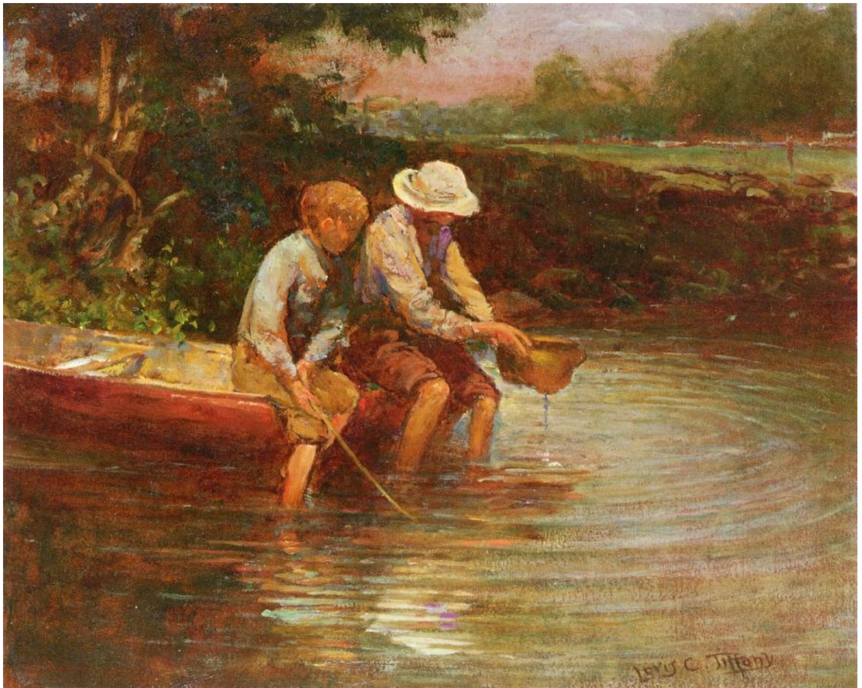
Painting - oil on board Louis Comfort Tiffany Boys Fishing 1900 40.64 cm x 50.8 cm