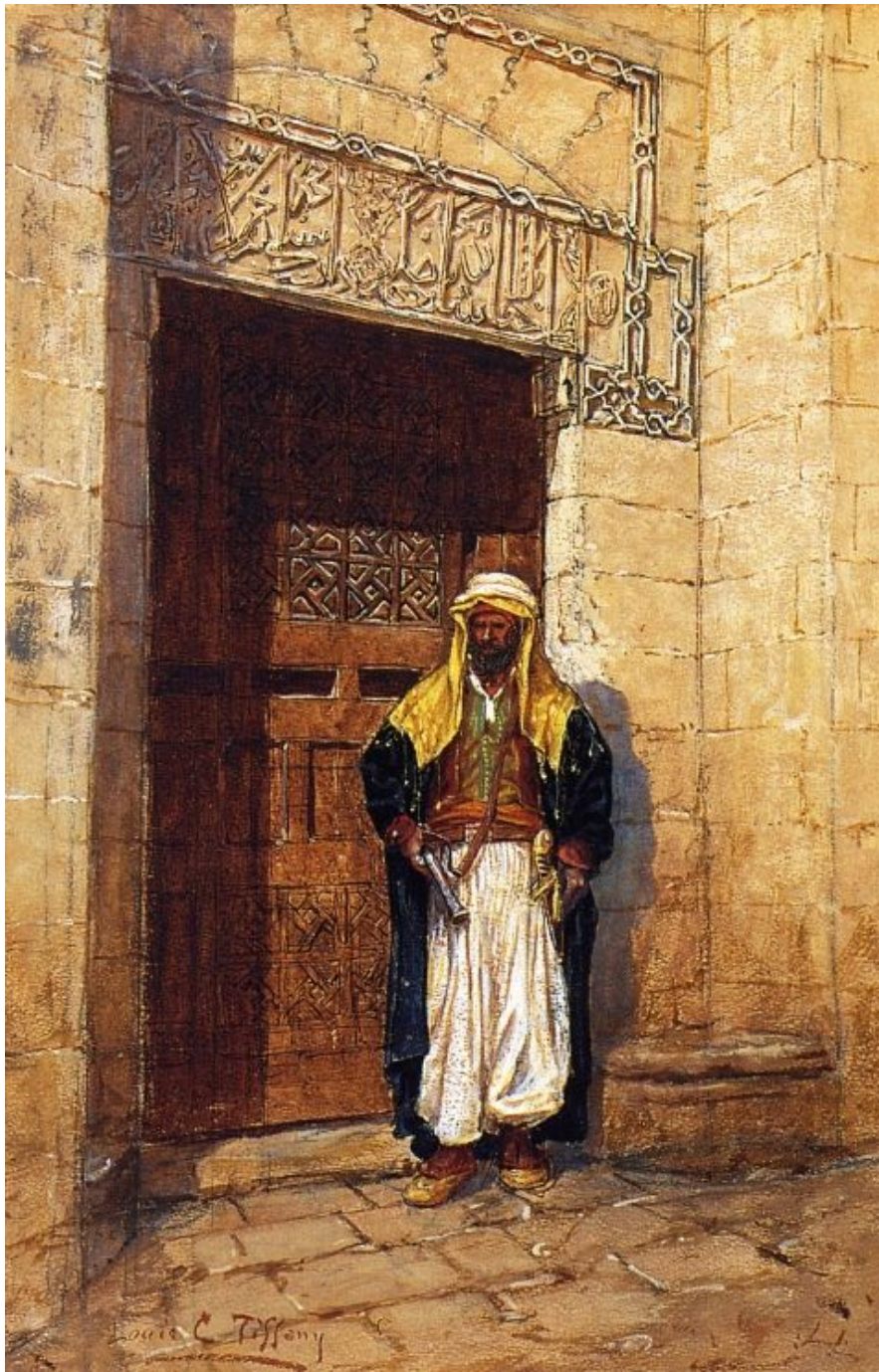
Louis Comfort Tiffany Arabian Subject 1880 Painting – watercolor and gouache on paper 38.74 x 25.4 cm