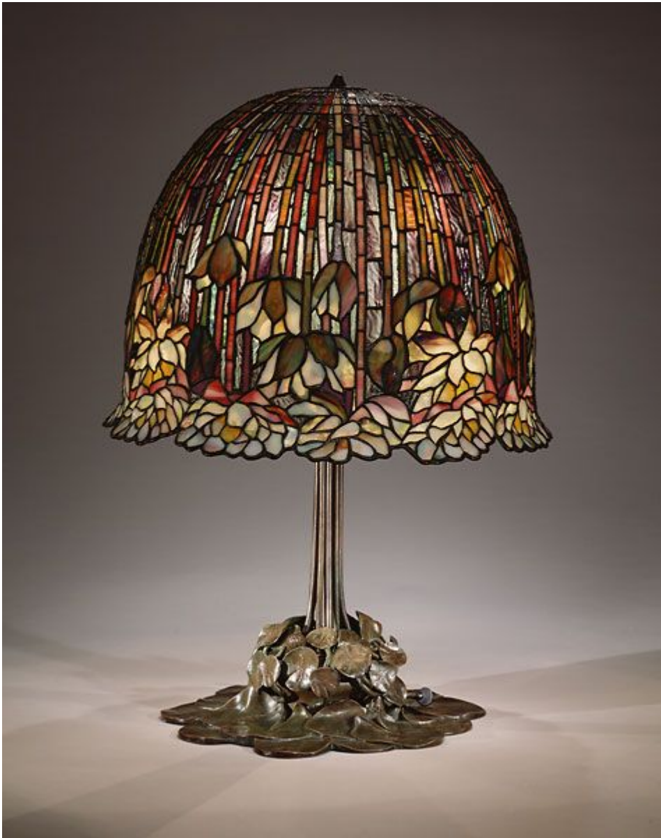
Louis Comfort Tiffany 1848–1933 table lamp Lotus or Water-lily 1904 – 5 Tiffany Studios 1902–1938 Leaded Favrite glass with bronze base, shade H 67.3; base 37.2 cm