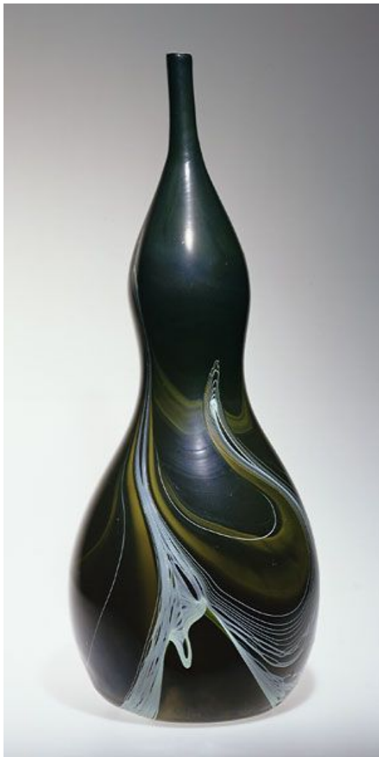
Louis Comfort Tiffany

Vase ca. 1893–97 Favrile glass, 51.4 cm.