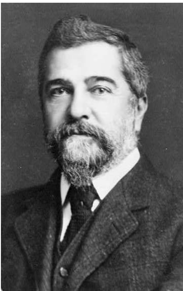
Louis Comfort Tiffany 1848 - 1933

Louis Comfort Tiffany 1848–1933 Dogwood ca. 1900–15 Tiffany Studios 1902–1938 Leaded Favrile-glass window 254 x 142.2 cm Inscription: (lower right, in black enamel block lettering)