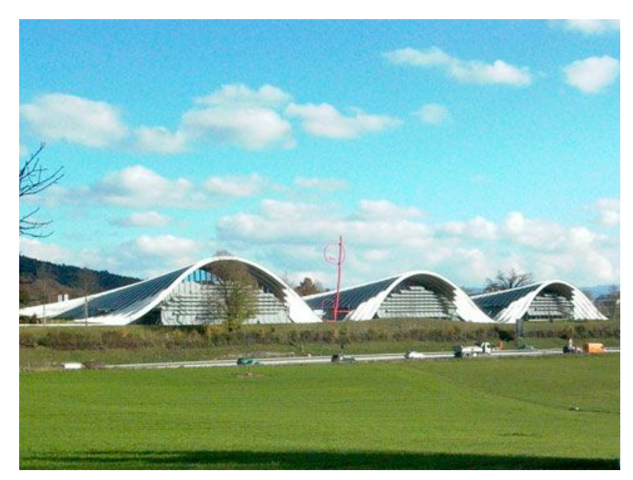
The Paul Klee Centre in Bern, opened in June 2005