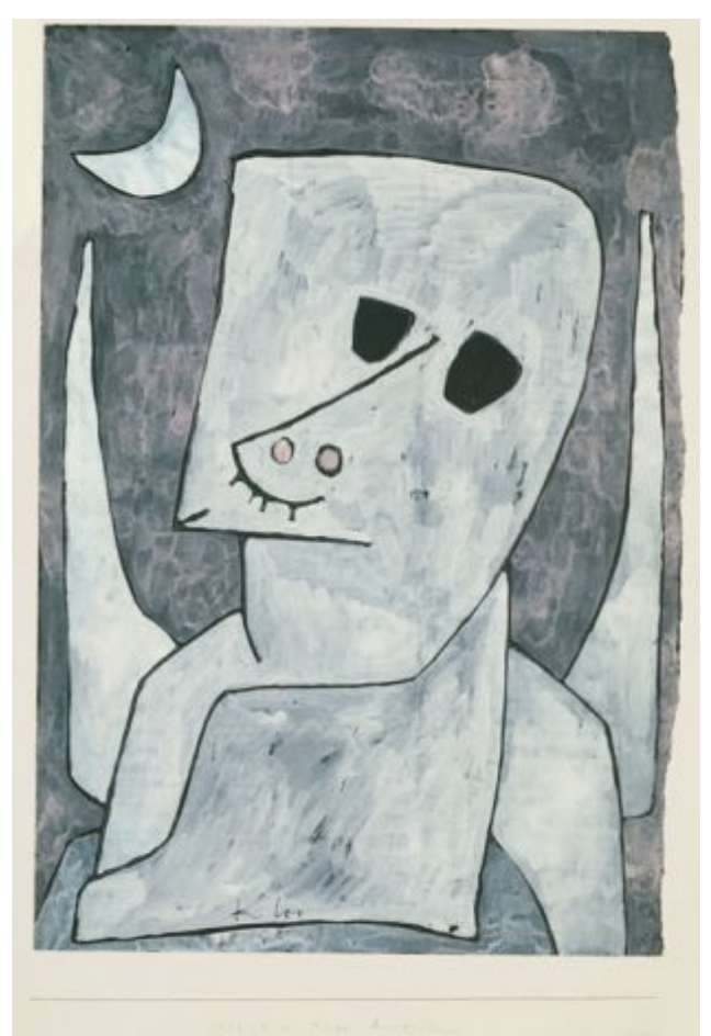
1939 Angel Applican Gouache, ink, and pencil on paper 48.9 x 34 cm