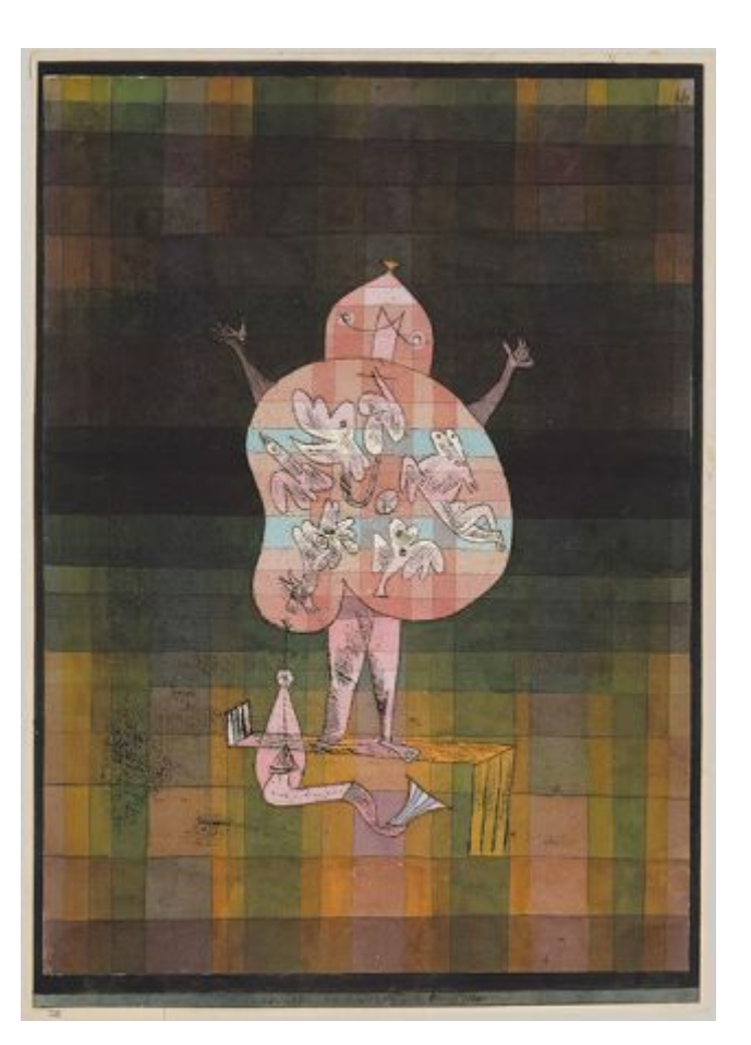
1923 ,Ventriloquist and Crier in the Moor Watercolor and transferred printing ink on paper, bordered with ink; 38.7 x 27.9 cm