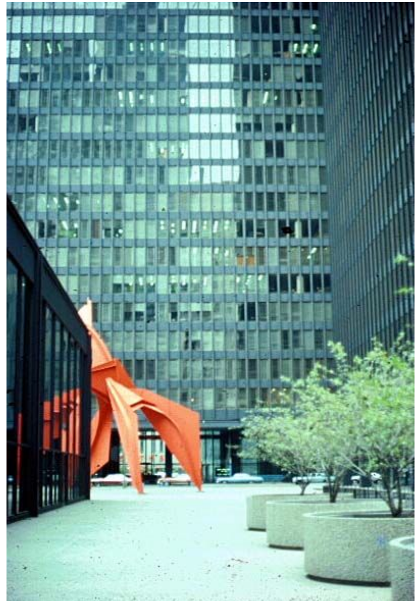
:Federal Center, Chicago IL (1959-74), Post Office Mies van der Rohe