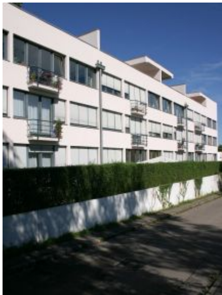
Wohnblock 1926 Weißenhofsiedlung Stuttgart