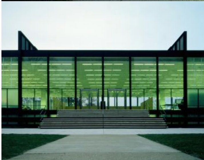
Crown Hall, Illinois Institute of Technology , Chicago, IL (1950-56), Ludwig Mies van der Rohe