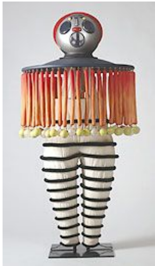
Oskar Schlemmer's Diver from Triadic Ballet (1922)

Figurinen 'Goldkugel' und 'Taucher', 'Der Abstrakte' aus dem 'Triadischen Ballett' (Erstaufführung Landestheater Stuttgart 1922), Stuttgart, Staatsgalerie