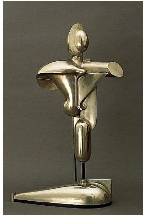
Abstract Figure, Sculpture in the Round edition of 1962 original 1921-23 Nickled bronze, 104 x 65.4 x 20 cm

example of the geometrical concept of the human body as employed by Oskar Schlemmer