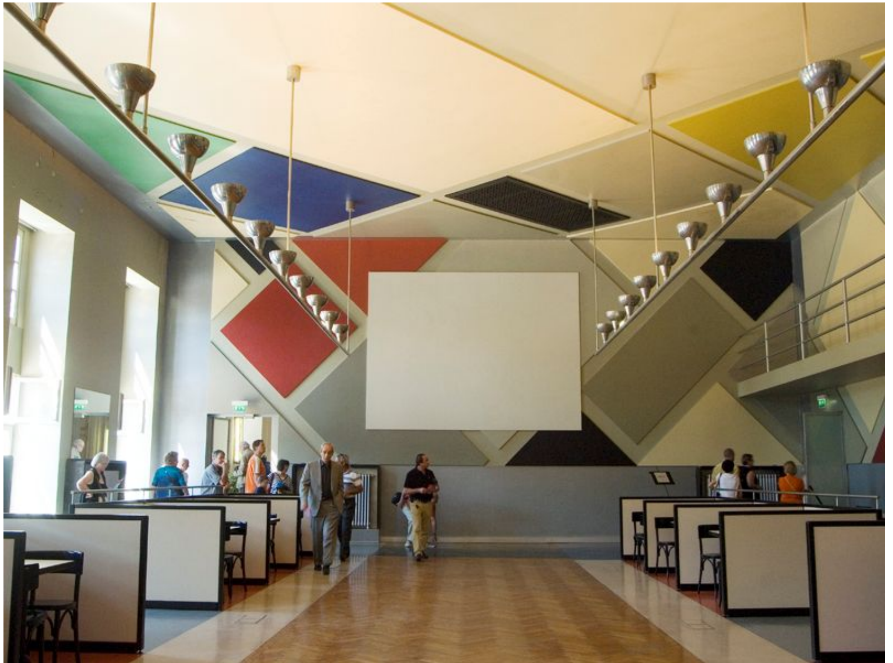
Theo van Doesburg with Sophie Taeuber-Arp and Hans Arp Sinebal in the Aubette in Strasbourg