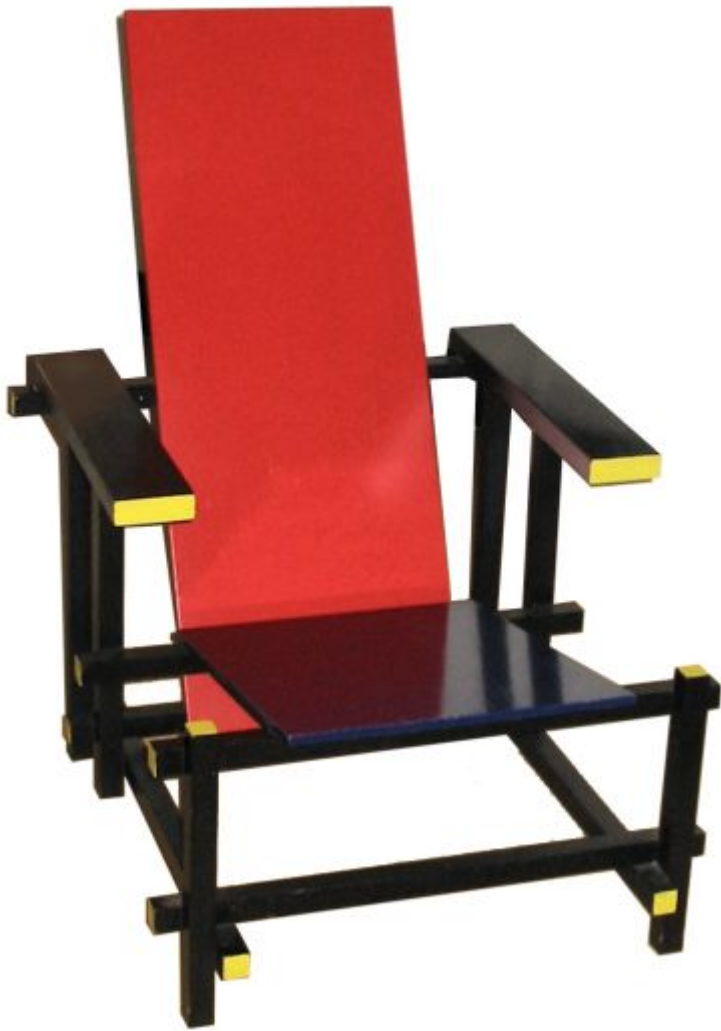
86.7 x 66 x (Dutch, 1884-1964) Rietveld .T Gerrit Red-Blue Chair 83.8 cm Hardwood 1923