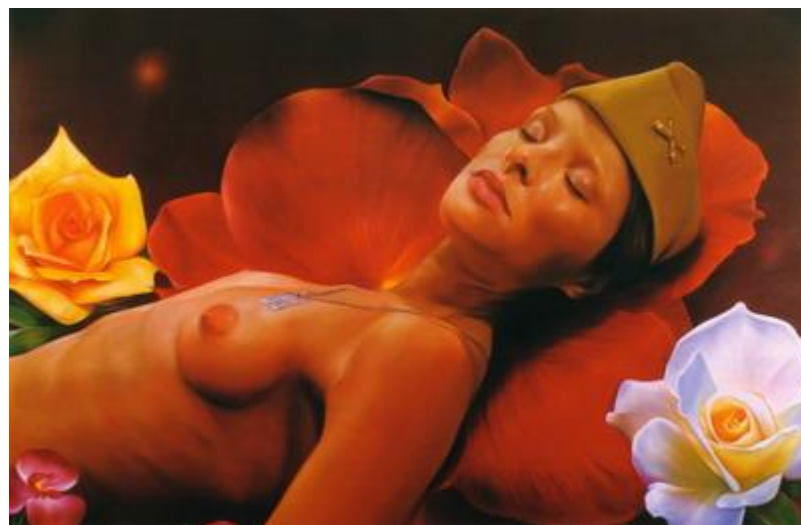
1994 , Women Soldiers Photo transfer, oil on canvas, glitter Collection of the artist