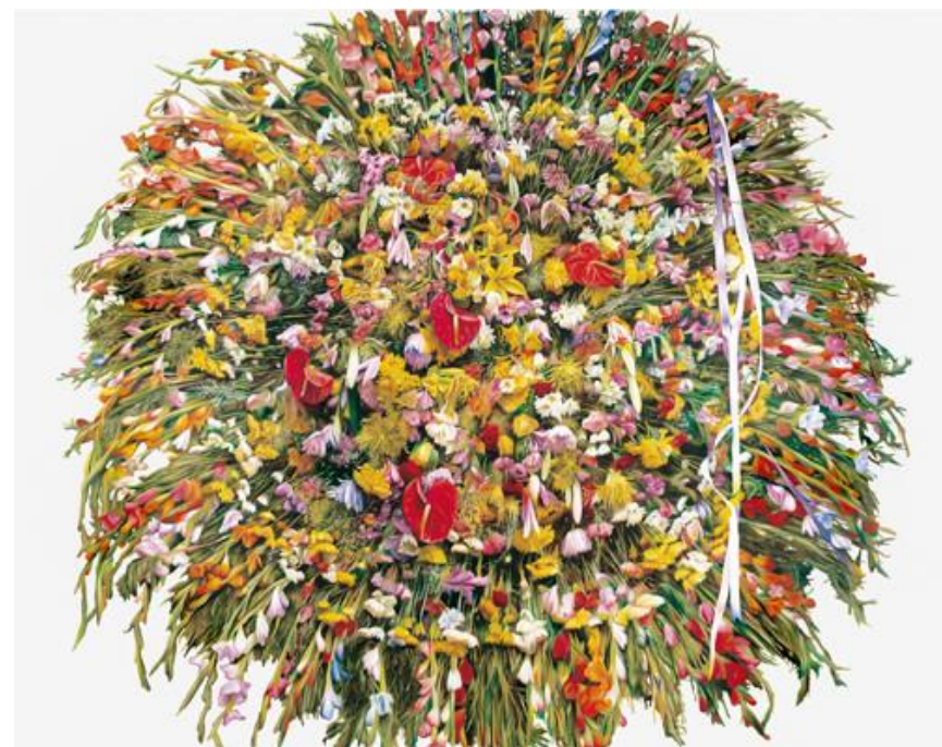
Flowers, 2003-04 Oil on canvas 110.25 x 82.5 inch