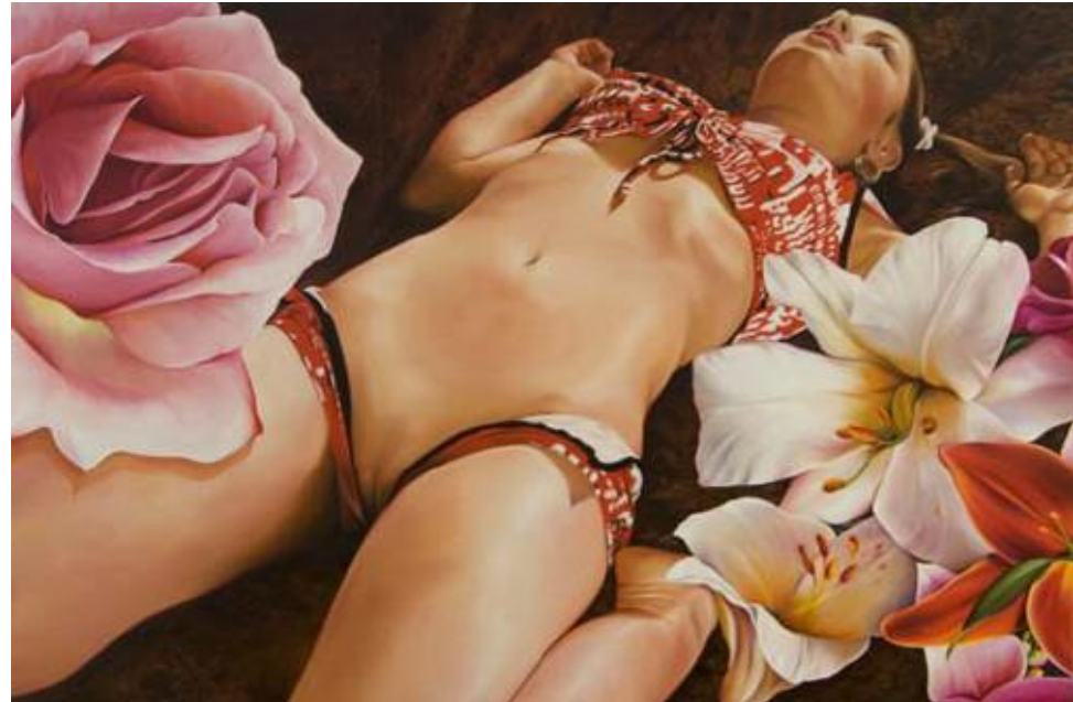
Porn Star, 2006• Oil on canvas 82x112.5 inch