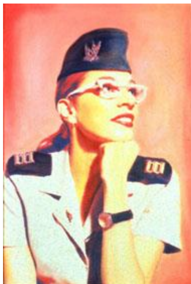
Nir Hod 1970 Israel Soldiers 1995 54 x 40 inch (each) oil on canvas