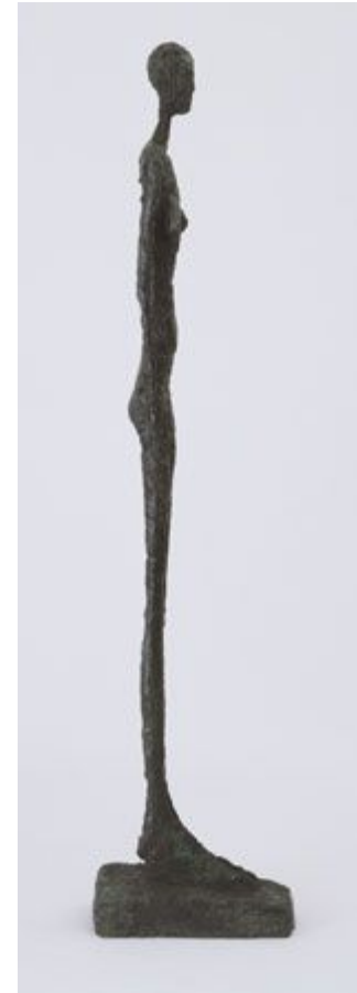
Alberto Giacometti. (Swiss, 1901-1966 1960 . Tall Figure, III . Bronze 236.2 x 29.5 x 52.4 cm .