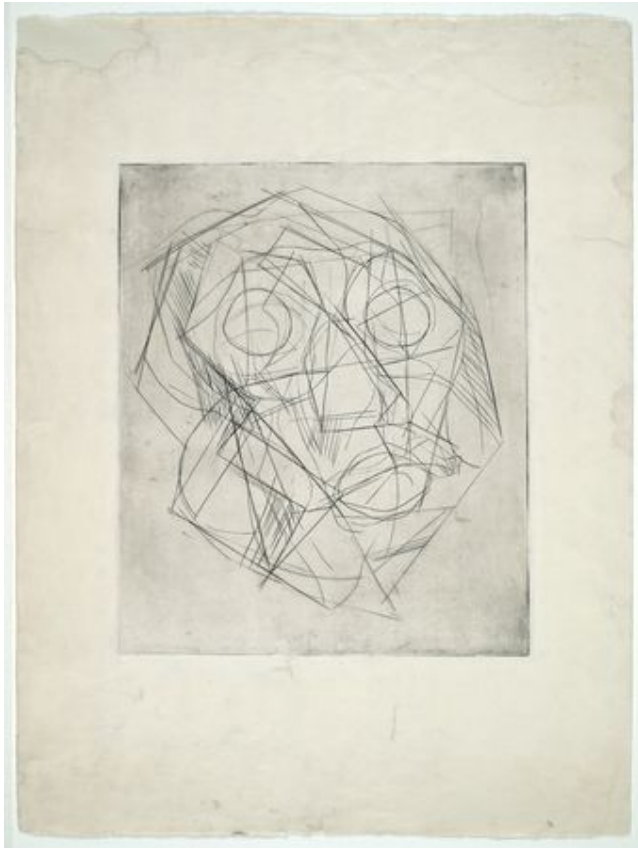
Alberto Giacometti. Swiss, 1901-1966 .1933 .Cubist Head Engraving, plate: 30.6 x 25.4 cm; sheet: 50.8 x 38 cm