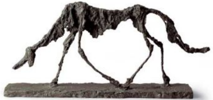
cast 1957 Alberto Giacometti, Dog, 1951