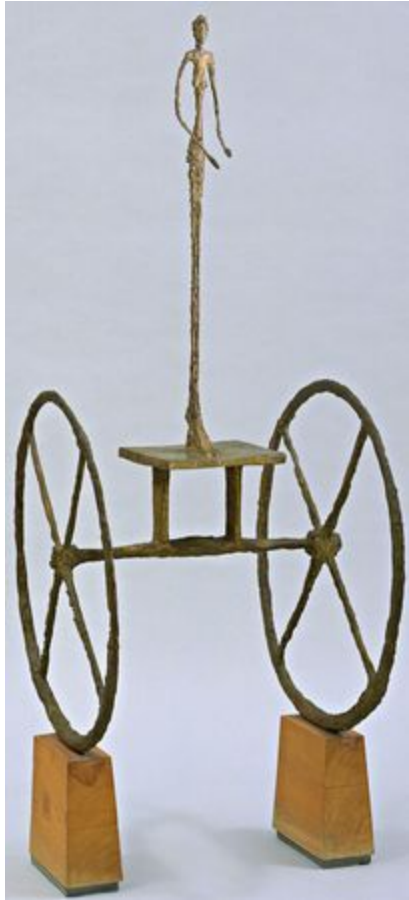
Alberto Giacometti. (Swiss) 1901-1966 .1950 . The Chariot Painted bronze on wood base 144.8 x 65.8 x 66.2 cm base: 24.8 x 11.5 x 23.5 cm