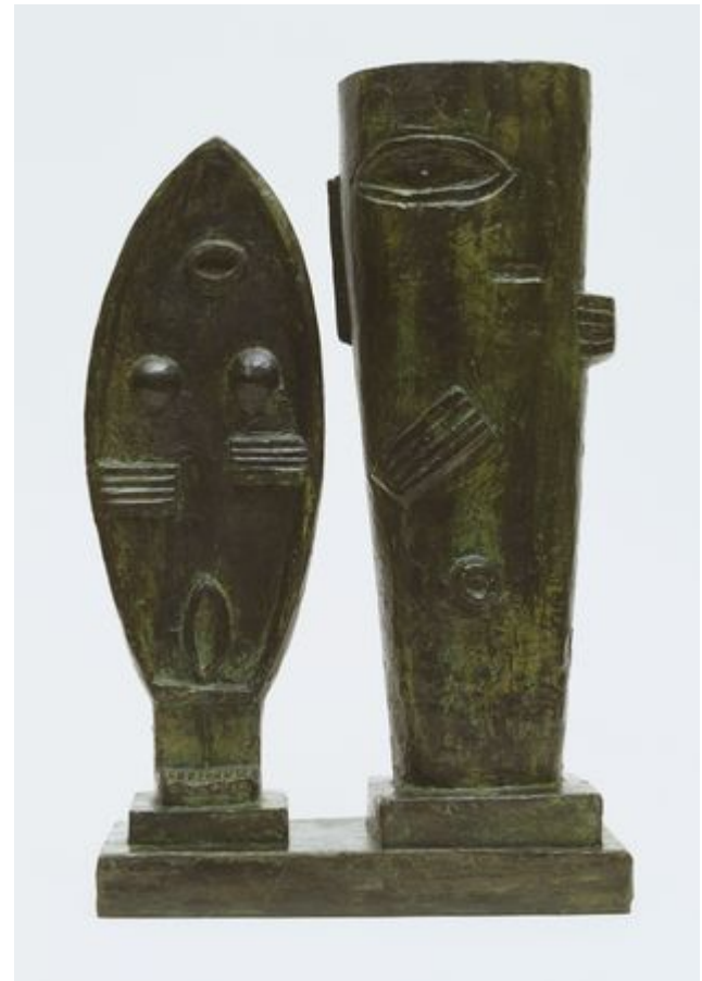
.Alberto Giacometti. Swiss, 1901-1966 1927 The Couple (cast 1955) Bronze, 59.6 x 38 x 17.5 cm