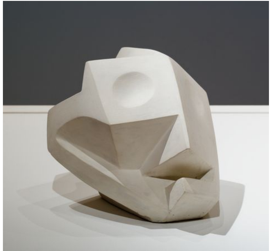
Alberto Giacometti Swiss, 1901-1966 .1933-34 .Head-Skull . Plaster, 18.5 x 20 x 22.5 cm