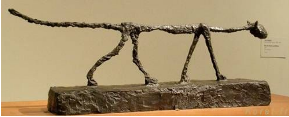
Alberto Giacometti : Kat