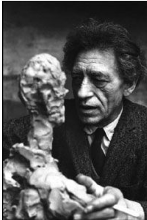
Giacometti, Alberto 1901-1966