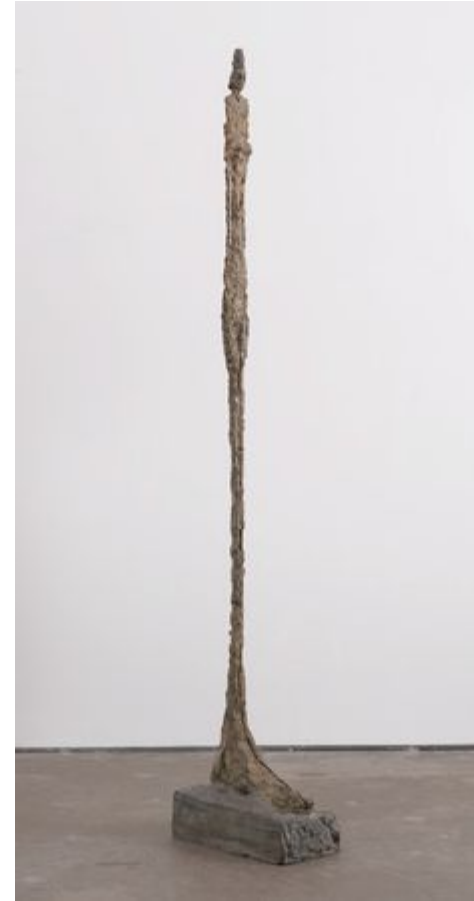
.(Alberto Giacometti. (Swiss) 1901-1966 1948 Standing Woman 166x16.5x34.2 cm