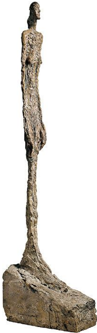
1956 , Woman of Venice Alberto Giacometti Swiss, 1901–1966 (Painted bronze; H 121.6 cm)