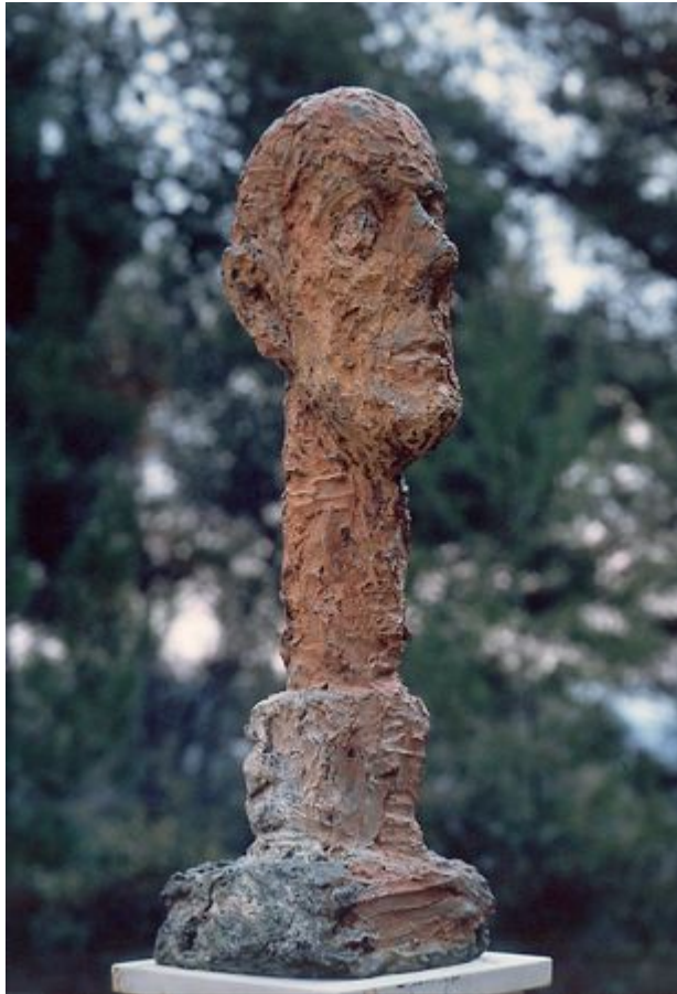
Alberto Giacometti Swiss, 1901-1966 1960 . Monumental Head . Bronze 95.3 x 30 x 33 cm