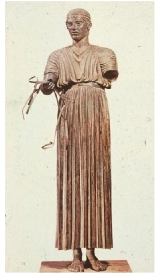
Charioteer of Delphi" • 470 BC. 1.80 cm