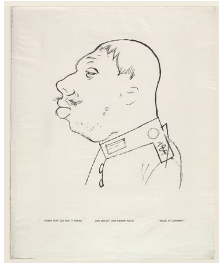
George Grosz, drawn in pen 1919, photo-lithograph published 1920 in the portfolio God with us Sheet 48.3 x 39.1 cm. In the collection of the MoMA