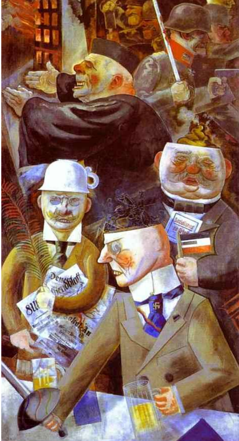
The Pillars of Society 1926 Oil on canvas. 200 x 108 cm. Nationalgal erie, Berlin,