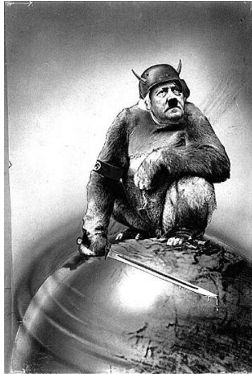
And Yet it Moves" 1943. A reference to a remark made by Galileo when he was forced to deny his belief that the Earth moved around the sun. Upon his release from the Inquisition, he stamped the Earth with his "foot and said, "And yet it moves