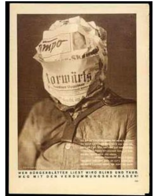
Whoever Reads Bourgeois ' Newspapers Becomes Blind and Deaf: Away With the Stultifying by John Heartfield '!Bandages appeared in the Arbeiter Illustrierte Zeitung (Workers Illustrated News) in ".1930