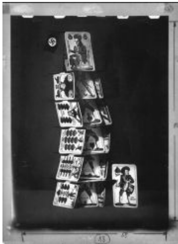
The thousand Year Reich